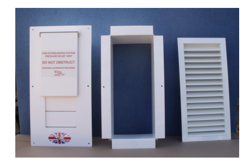
External Model showing Under Pressure Self Closing Door & Over Pressure Fire Blades, Telescopic Duct & Full Size . Weather Louvre

The range of nine individual models has been designed with the maximum available Free Vent Area available from a proven and tested design. The blade design, construction, and assembly has been tested by Exova Warrington to BS EN 1634 -1:2014 - Rated at 4 Hours. All PRD's have Fire Classification to BS EN 13501-2 - E240 & EW120.